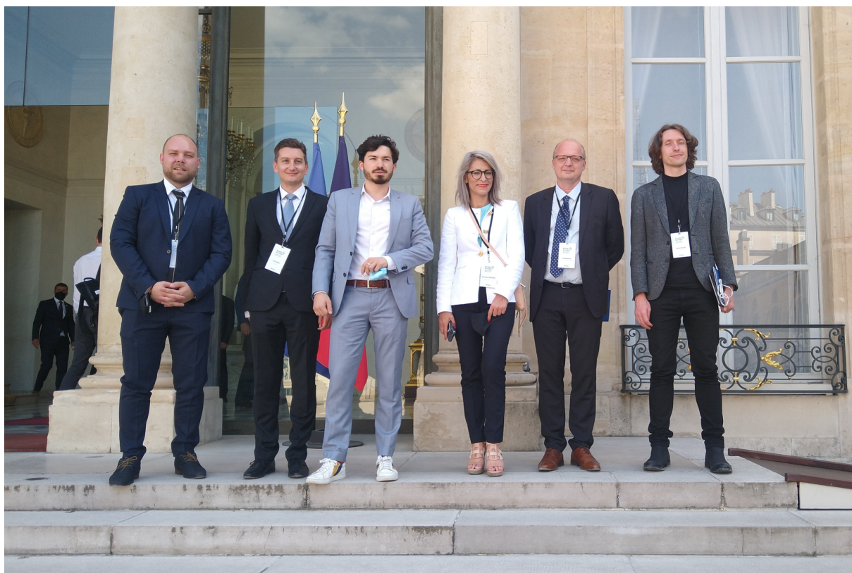
The ESN delegation at the Elysée palace before the presentation of the Scale-Up Europe Manifesto to president Macron